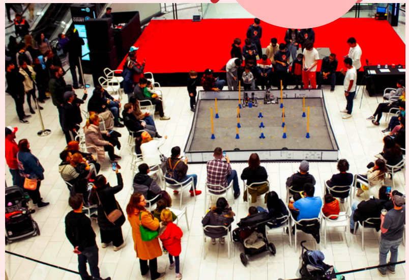
American Dream Outreach Event